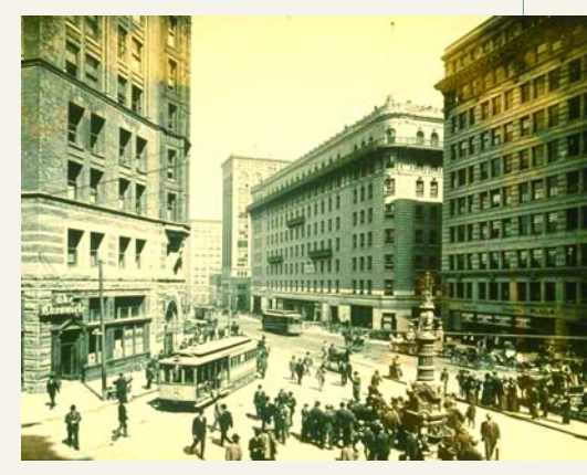
This photo was taken three years after the 1906 earthquake. Looking from Kearny Street facing Market Street east; from left: Chronicle Building, Palace Hotel and Monadnock Building.

Thanks in large part to the generous sponsorship of Sonnenschein, Nath and Rosenthal, the price for admission is free, but you must sign up in advance. Bring your families to this fun-filled out-door event. Let's have a lot of fun, meet up with old friends, meet new friends and kick off the 2003 ABA Annual Meeting with a bang (not including dynamite, of course). A wide variety of hors d' oeuvres will be available, as well as wine, beer and other refreshments.